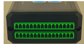
Dissociable screw fastening HARTMAN 2x 16PIN