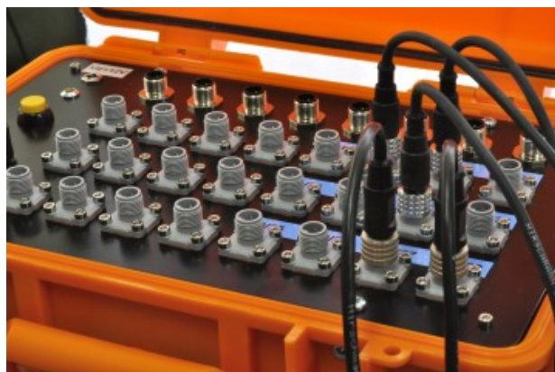
Front panel of system AV32MAKP.32:

System cooperate with program APEK Assist to configuration, presentation and data archiving. System AV32MAKP can be equipped in modem GSM/GPRS which is used for remote send of measurements, all results are accessible on net in program APEK NetPrezenter or in viewers.