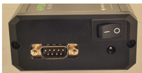
RS232 or RS422 port.