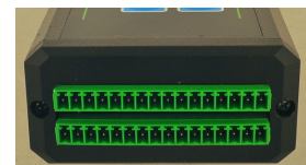
Dissociable screw fastening HARTMAN 2x 16PIN